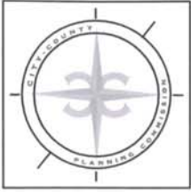
EXHIBIT D Local Historic Districts and Sites See Section 4.9.3

Note: National Register designated and eligible properties and districts are not displayed on this map. Please consult the Historic Preservation Office prior to undertaking any work. Bowling Green is a certified Local Government.